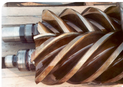
Right - Figure 1: Screw-type compressors operated with mineral oil (left) and high-performance oil (right). The conveyor using high-performance oil is sludge and varnish free, bringing the plant operator higher compressor efficiency and lower maintenance costs.

Therefore, the use of high-performance synthetic lubricants is recommended, as these oils contribute significantly towards maximising machine reliability, the reason being that high-performance